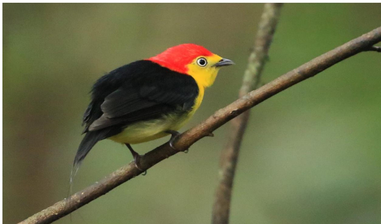
Wire-tailed Manakin, Puerto Inírida, Colombia

Finally, a sampling of more widespread Amazonian species—for example, birds more typical of Amazonian regions to the south—that occur in the Inírida region include all of the following and many more: Capped Heron, Greater Yellow-headed Vulture, Hook-billed Kite, Little Cuckoo, Sand-colored Nighthawk, Reddish Hermit, Black-eared Fairy, Amazonian Motmot, Spotted Puffbird, Swallow-winged Puffbird, Gilded Barbet, White-throated Toucan, Scarlet-shouldered Parrotlet, Cobalt-winged Parakeet, Black-headed Parrot, Blue-crowned Trogon, Lafresnaye's Piculet, Cream-colored Woodpecker, Red-necked Woodpecker, Red-and-green Macaw, Fasciated Antshrike, Amazonian Antshrike, Dot-backed Antbird, White-cheeked Antbird, Long-billed Woodcreeper, Yellow Tyrannulet, Ruddy-tailed Flycatcher, Citron-bellied Attila, Spangled Cotinga, Bare-necked Fruitcrow, Amazonian Umbrellabird, Screaming Piha, White-browed Purpletuft, Várzea Schiffornis, Wire-tailed Manakin, Golden-headed Manakin, Tropical Gnatcatcher, Violaceous Jay, Black-faced Tanager, Paradise Tanager, Burnished-buff Tanager, Flame-crested Tanager, Fulvous-crested Tanager, Pectoral Sparrow, Epaulet Oriole, Velvet-fronted Grackle, and both Green and Olive oropendola.