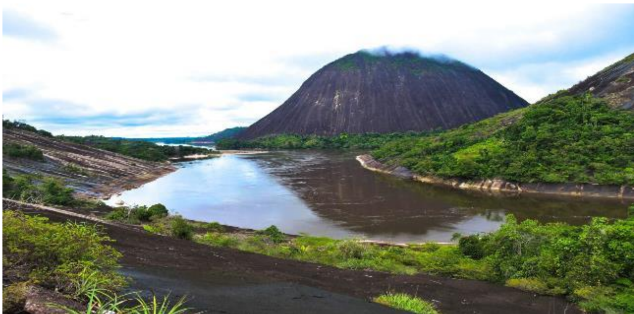
Rio Inírida and Cerros de Mavecure near Puerto Inírida, Colombia

There will, of course, be many other species, some widespread, others less so. There also will surely be a few surprises in this region because there has been relatively little attention here from birders or the ornithological community. And, added to some exciting birding will be an exotic landscape of alluring, domed mountains, rocky outcrops and blackwater rivers, that seem as if they could have been drawn straight from Sir Conan Doyle's fictional The Lost World.